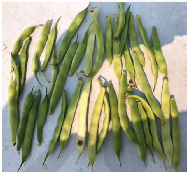
Untreated 36 pods/plant More yellowing; Maturing more quickly