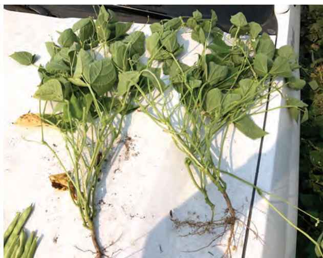
Untreated Lower leaves firing-off Newest pods limp and aborting