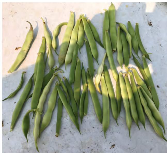
Aquimax® Broadacre 46 pods/plant Delayed maturity