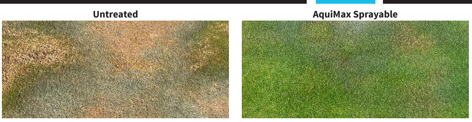
University of California Riverside, 2022